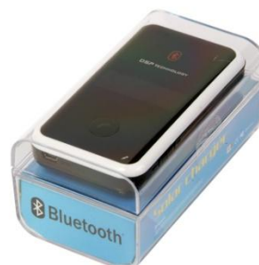
SOLAR POWERED BLUETOOTH CAR KIT WITH CALLER ID